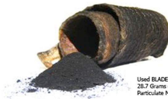
Used BLADE Cartridge with 28.7 Grams of Captured Particulate Material

Blade Your Ride... because you should feel good about what you drive. www.BladeYourRide.com