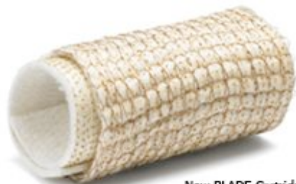
New BLADE Cartridge

Particulate Material (soot) is an air pollutant known to cause grave environmental and human health consequences. Environmental consequences of PM include: air pollution, water pollution, deforestation, crop degradation, acid rain, acidification of waterways, and smog. Health consequences of PM include: cancer, cardiovascular and respiratory disease, fibrosis, asthma, reduced pulmonary function and increased mortality.